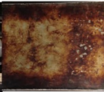
Sheet Pan Cleaner