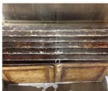
Cake Pan Cleaner