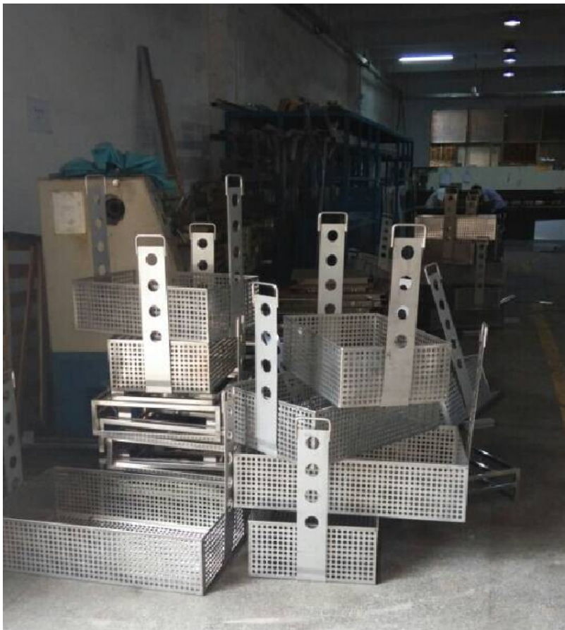
Cake Pan Cleaner