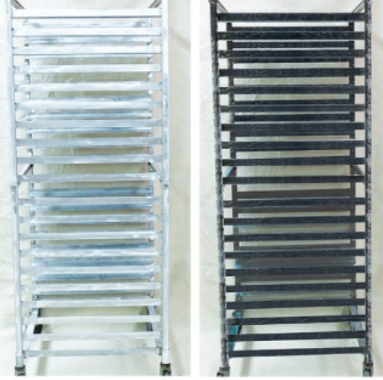
Bakery Rack Cleaner