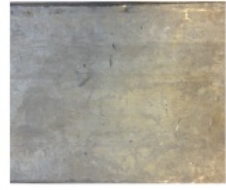
Sheet Pan Cleaner

Application: Ultrasonic works well on the below items to take away grease, dirt, oil, pigments