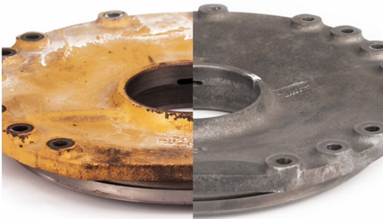
Dust and oil remove